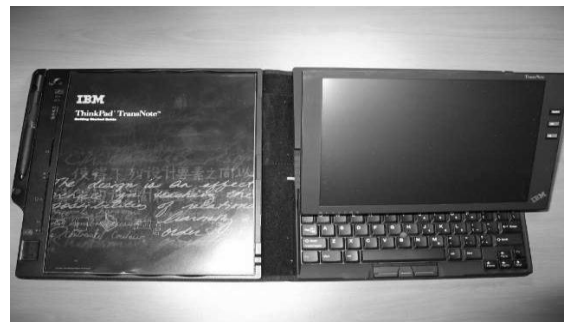
Fig 1.3 IBM TRANS NOTE

Signature verification could be done on-line and through a communication link while the credit-card user is purchasing merchandise.